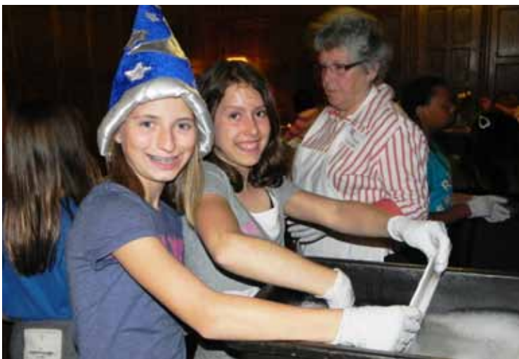
Members of our Mid High Youth Group served dinner and visited with guest families from South Oakland Shelter.