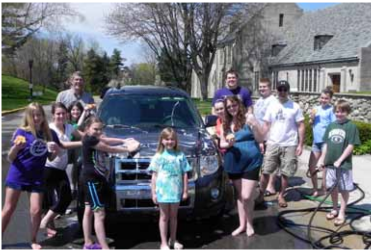
Thank you for your support of the Senior High Car Wash. We raised almost $900 to support our Summer Mission Trip to Jacksonville, Florida!